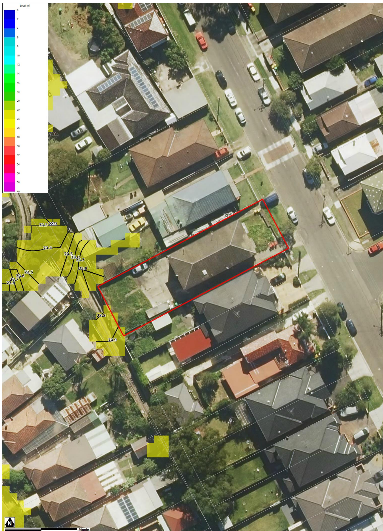
100yr ARI Flood Extent